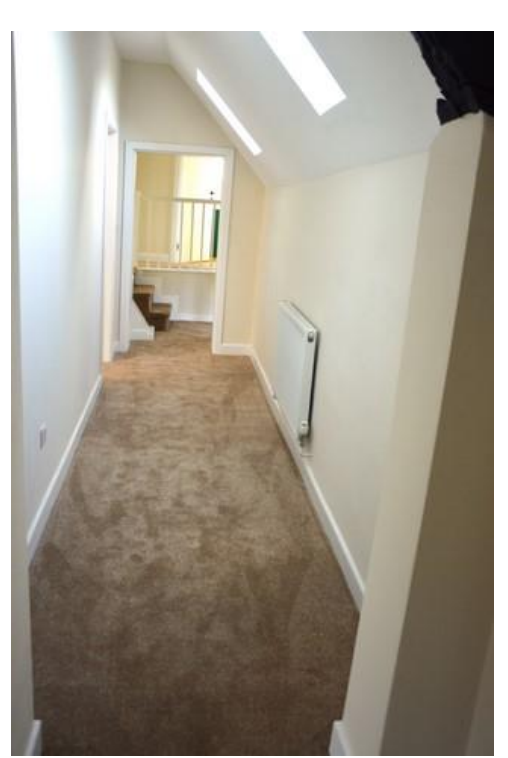
6.49m x 1.25m (max) (21'3" x 4'1") Newly fitted carpet, 4 x Velux windows and fitted radiator